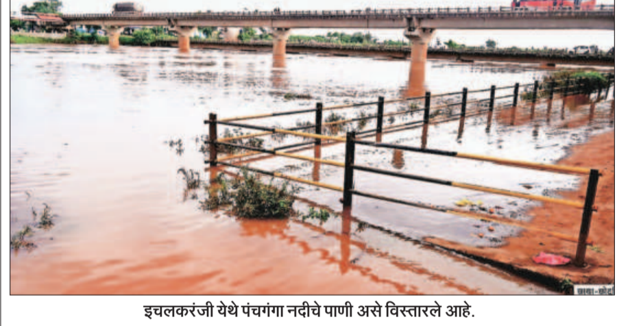
इचलकरंजी येथे पंचगंगा नदीचे पाणी असे विस्तारले आहे.